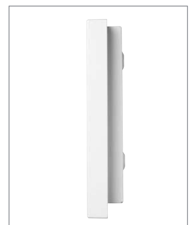
40mm slim profile of Britesign 2 minimised further using stepped frame design